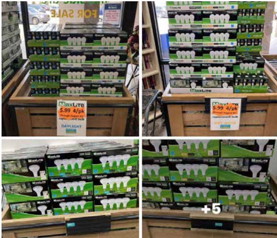
Habitat ReStores are proud to sell MaxLite products to local homeowners and businesses.

“The MaxLite program has been a huge benefit to us here at the Charlotte Region ReStores. We have a number of customers that come in specifically for the bulbs/fixtures. It goes without saying that most of them take a look around the store and purchase other items while they are there. We have significantly increased our average item per sale and sell a large number of MaxLite items. We are very happy with the program and very thankful to be part of it.”