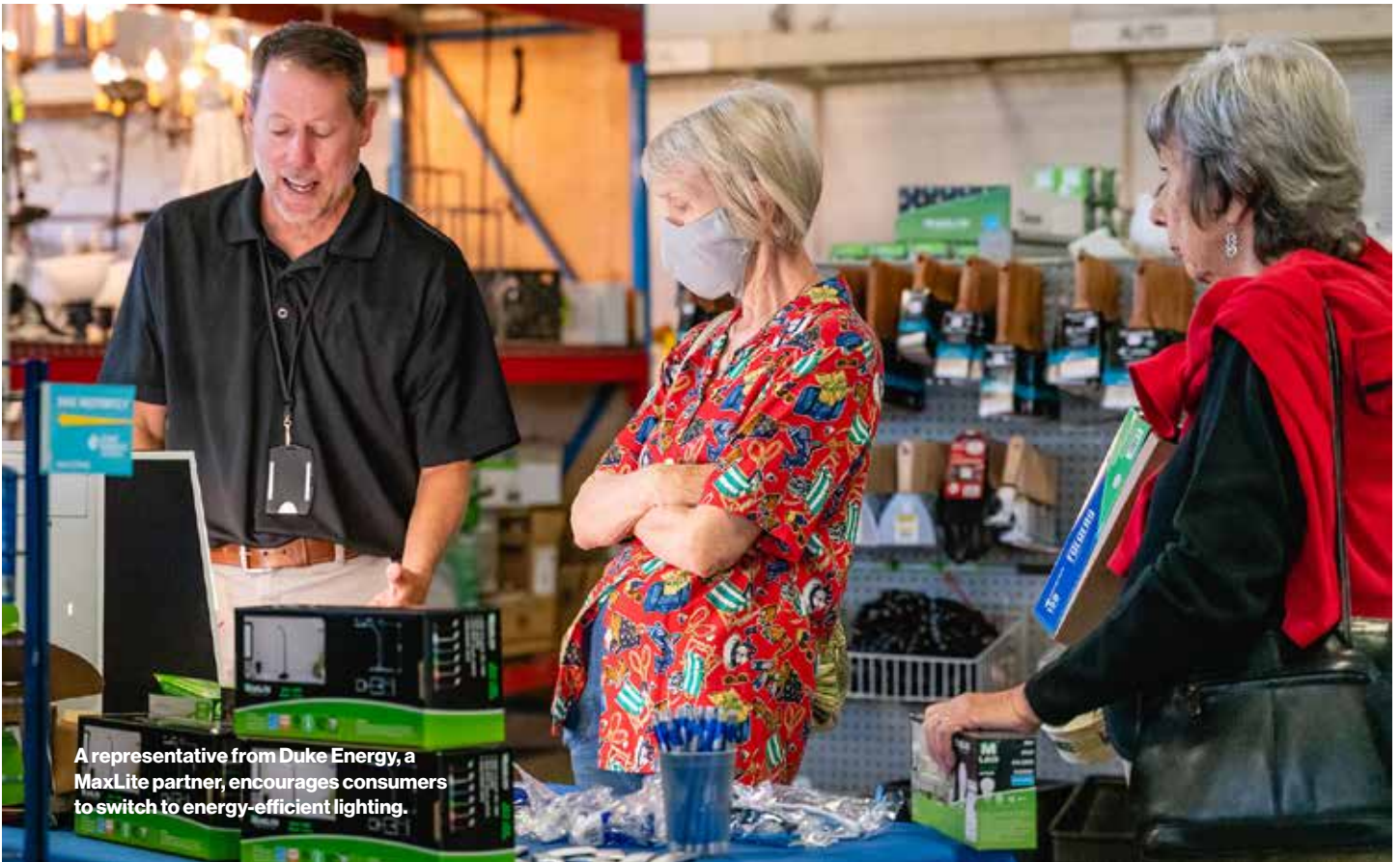
A representative from Duke Energy, a MaxLite partner, encourages consumers to switch to energy-efficient lighting.