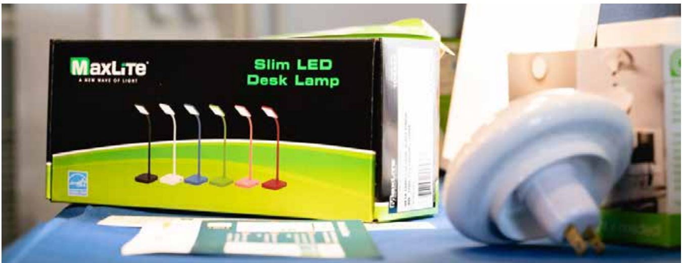
MaxLite products save energy and help protect the environment without sacrificing features or performance.